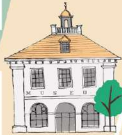
Market Hall Museum