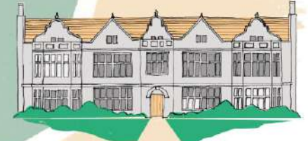
St John's House